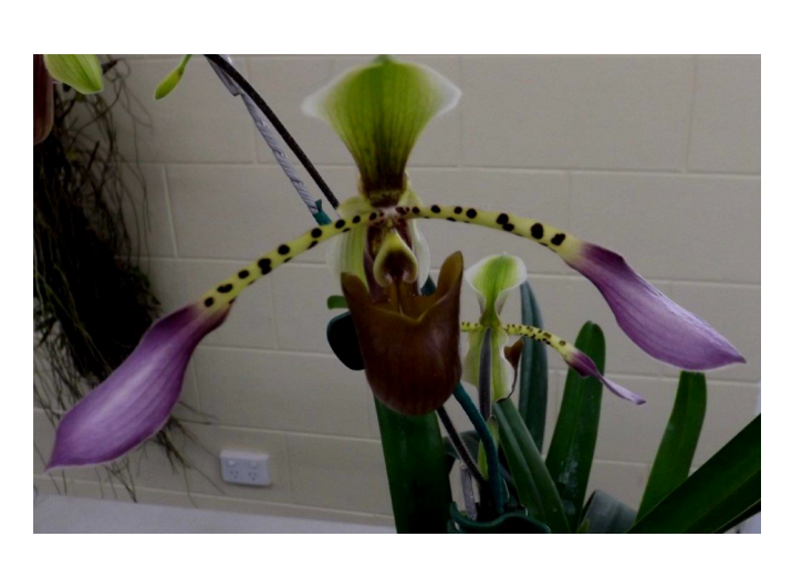
SPECIES:: Paphiopedilum lowii 80 points C & H Osborne