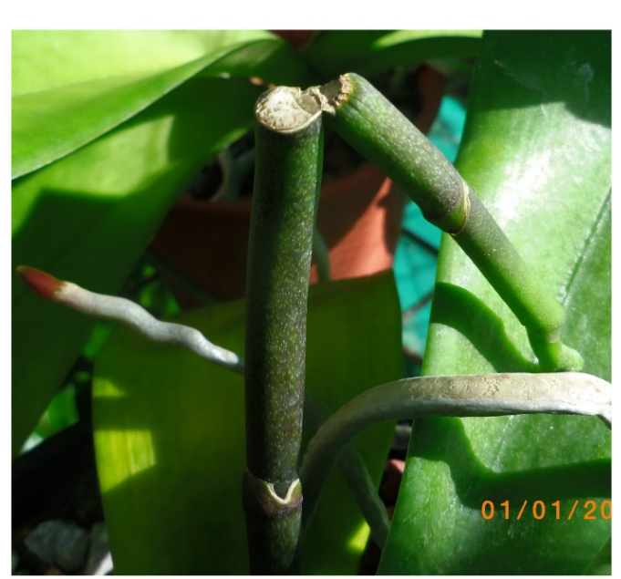
Oops! - A Phalaenopsis spike that needed protection with some staking

1. To protect the orchid plant and/or flowers from mechanical and water weight damage. Mechanical damage can occur simply by brushing against that nice inflorescence as you walk past. Had the inflorescence been secured to a stake of some description, then the chances are that damage would be avoided. Mechanical damage is of major concern when many orchids are stuffed into the car and transported, often over considerable distances, to shows. A lack of protection often results in flowers being broken off. Any orchids that have long inflorescences are at danger of breaking due to the weight of water on the flowers (not that any knowledgeable orchid