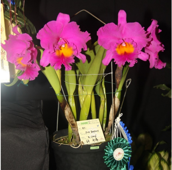
Ric. Pink Empress 'Ri Cheng" at TIOS 2016 showing effective staking ensuri bulbs and flowers are upright and clearly displayed.

But how do you stake, and what materials are best to use? Well the simple answer to this is, "There are as many different approaches there are orchid growers". Your best bet is to check out the plants, especially those that win prizes at orchid shows, and see how others do it. Popular stakes include wire, often plastic covered, aluminium wire and bamboo sticks, with green clips or pieces of thinner wire being used to attach the plant or inflorescence to the stake. Many growers also attach their stakes to the pot, while many others do not. Remember that it is always safer to bend over all exposed wire ends to lessen the chances of damaging one's eyes while taking a very close look. It is more important when reusing bamboo, and other wooden stakes, that they be sterilised.