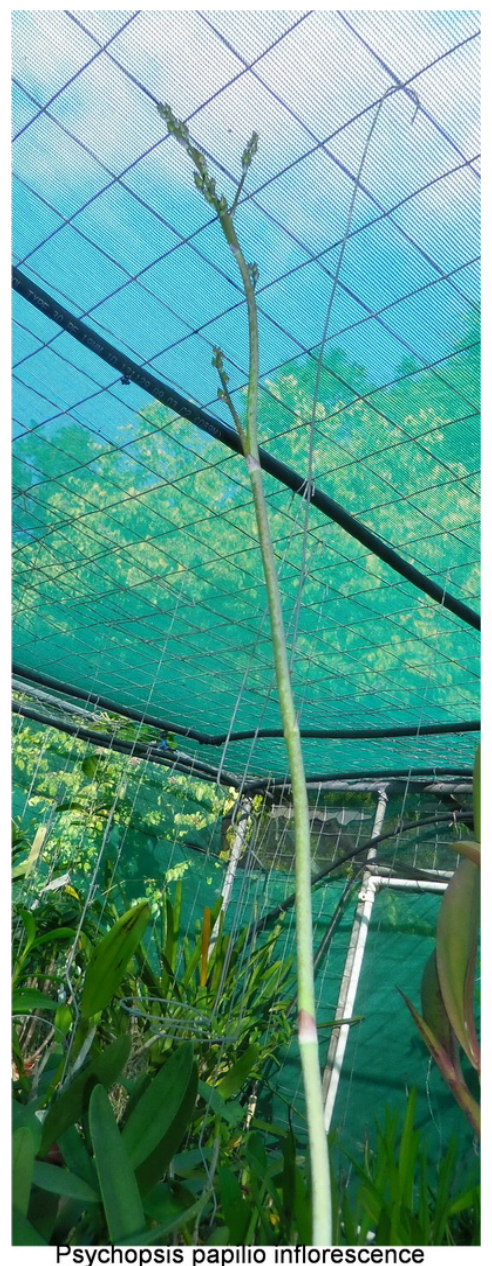
Psychopsis papilio inflorescence heading for the sky (needs staking?)

2. We often stake to train the orchid to grow in a manner that we would like it